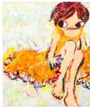
六角彩子 / Ayako Rokkaku

香港秋季拍賣會中，六角彩子創作與2007年的亞克力作品“ORANGE DRESS”超越預估高價以36萬3千港幣成交。之後加藤泉的油彩作品也經多方電話競拍爭搶，超過預估高價以42萬3,500港幣成交。此外，菲律賓藝術家費爾南多·阿莫索羅的風景畫作品以84萬7千港幣成交。對日本前衛藝術影響巨大的法國藝術家喬治·馬修的作品以133萬1千港幣成交，西蒙·漢的“ETUDE”經過白熱化的競價以133萬1千港幣成交，優秀的作品一一順利落錘。