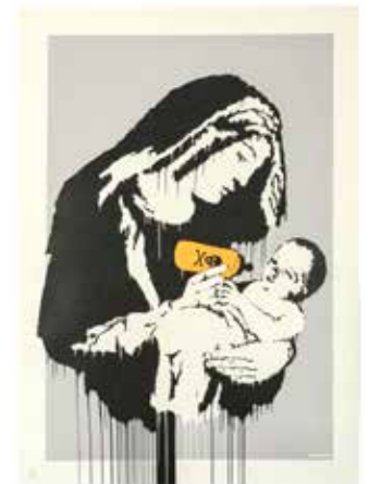
班克斯 / BANKSY

Urban art and Contemporary art recorded a good result with successful bid rate 85% of all 162 lots in last autumn sale in Tokyo on October 20. Banksy's work "TOXIC MARY" was effected by the news about Banksy's work cut with a shredder just after a successful bid at overseas auction house, sold at JPY 2.3 million which is exceeded the low estimate JPY 800,000.